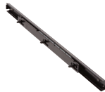
Seat Cushion Extender