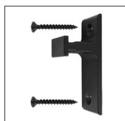
RT-WMS-BK Wall Mounted Bracket, Short