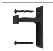
RT-WML-BK Wall Mounted Bracket, Long