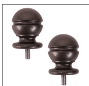
RT-ESBZ End Stop