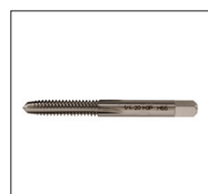
RT-TES Tap for Rail/End Stop