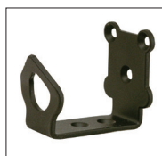
RT-UGS-BK Universal Guide