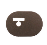
RT-BPSBZ Bi-Part Stop