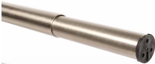
Brushed Nickel (BN)