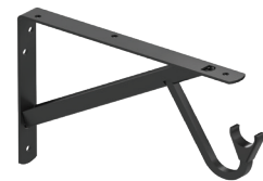
0495 SHELF & ROD BRACKET