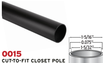
0015 CUT-TO-FIT CLOSET POLE