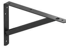
0494 SHELF BRACKET