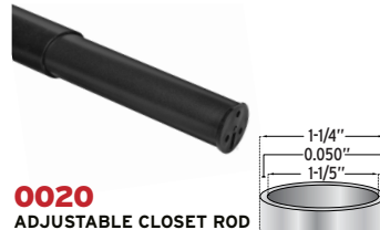
0020 ADJUSTABLE CLOSET ROD