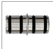
SS-RR-C Round Rail Connector