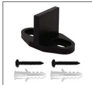
SS-GWD Wood Door Guide